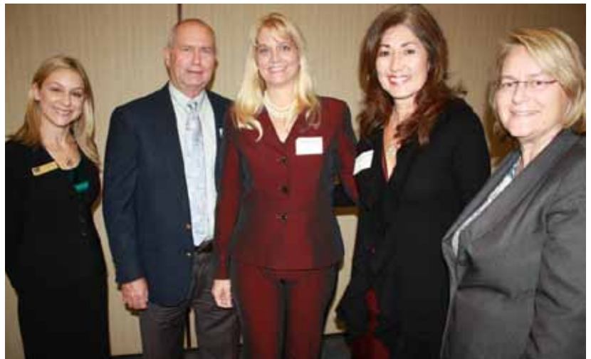
Holiday Party Attendees