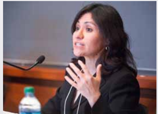
Commissioner Edith Ramirez